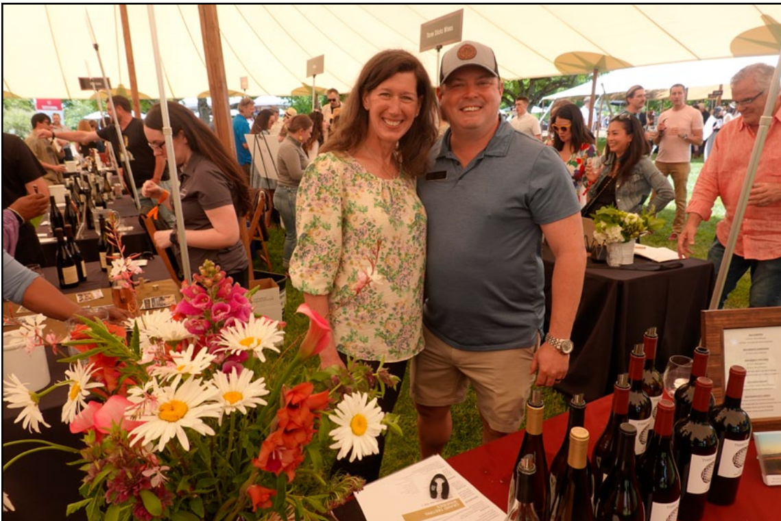
Owners of Thirty-Seven Wines pouring their wines.