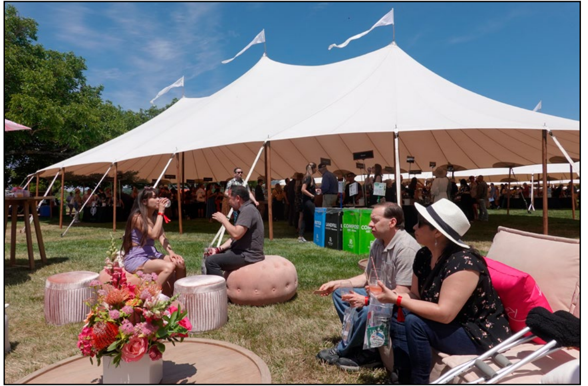
Guests relax at the Sonoma County Vintners Association Wine Tasting.

The Pride vineyard straddles the county line and this wine is 81% Sonoma and 19% Napa fruit. The cepage is 72% Merlot and 28% Cabernet Sauvignon. The Pride Claret has aromas of cassis, blueberry, tobacco, earth with floral notes. Medium-bodied, seamless and fleshy bursting with black fruit, it's a layered, concentrated wine with rich tannins and a long, savory finish. This is only going to get better in the cellar.